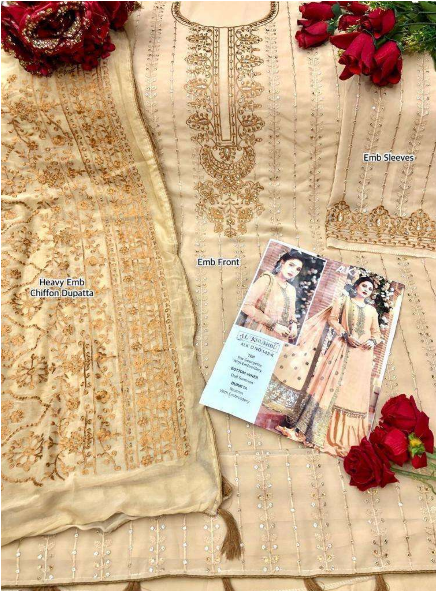
Heavy Emb Chiffon Dupatta