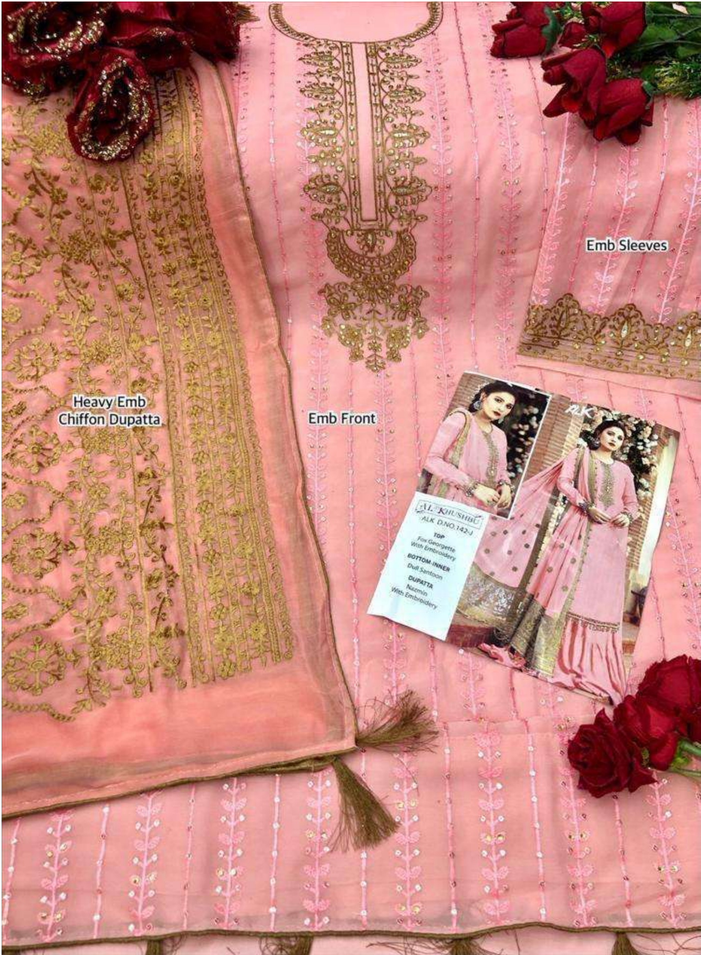
Heavy Emb Chiffon Dupatta