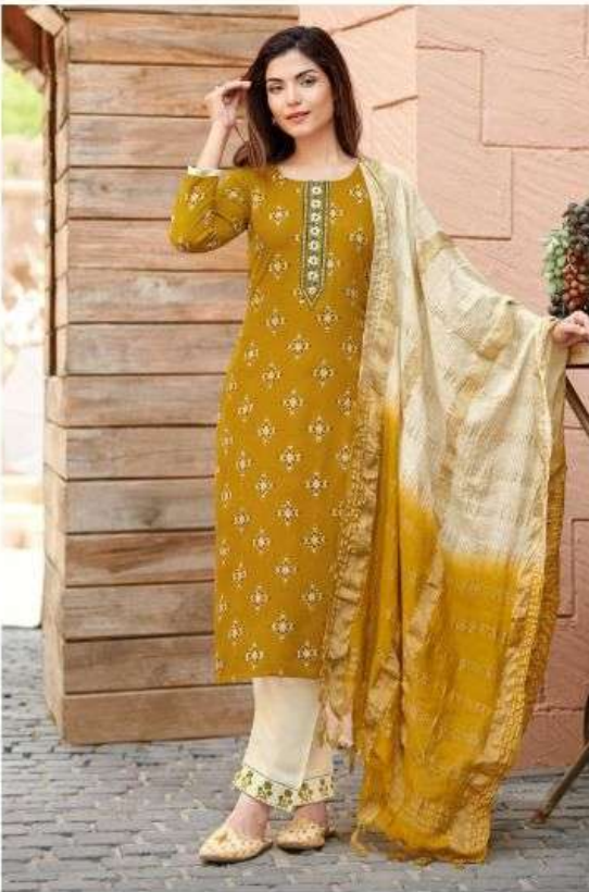
D. NO- 3003