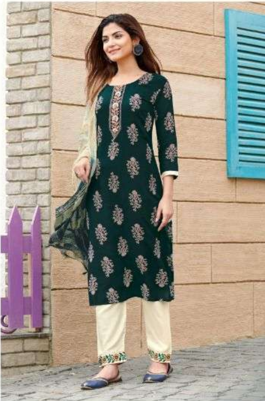
D. NO- 3001