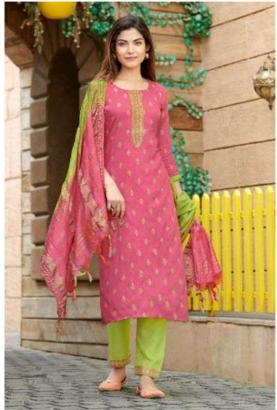
D. NO- 3002