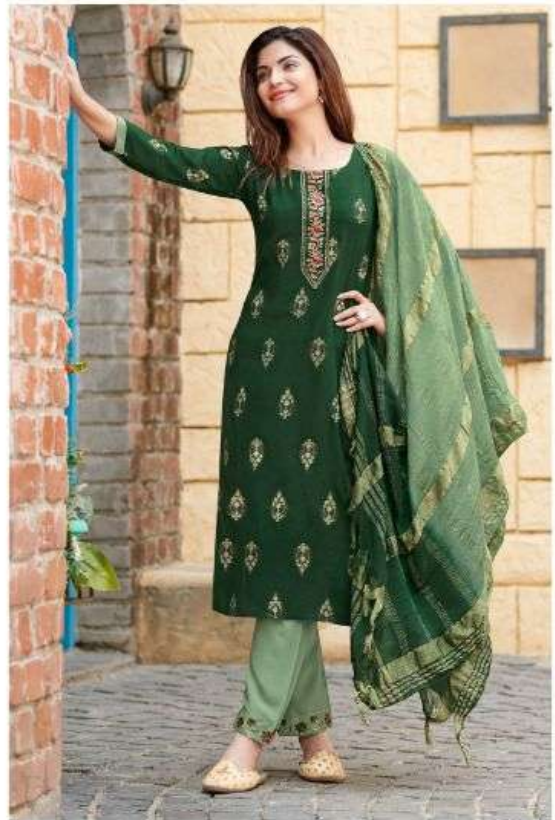
D. NO- 3004