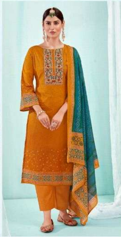
❖ CODE | 1002