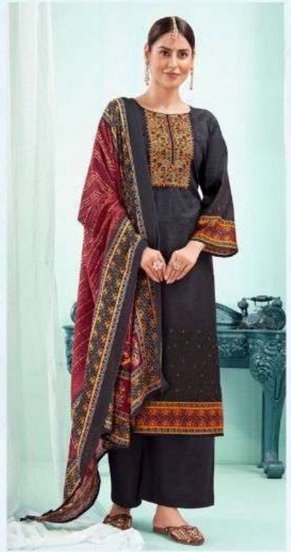
❖ CODE | 1003