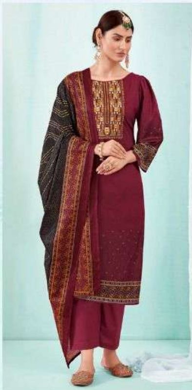
❖ CODE | 1005