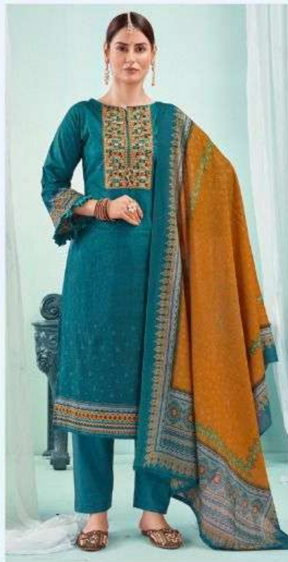
❖ CODE | 1006