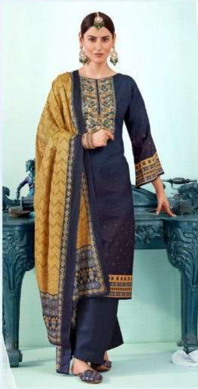
❖ CODE | 1001