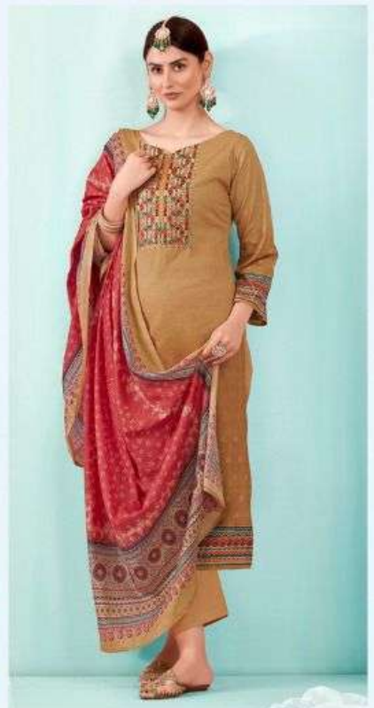
❖ CODE | 1007