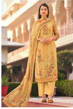
◆ 2529 ◆