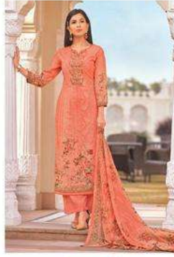
◆ 2530 ◆