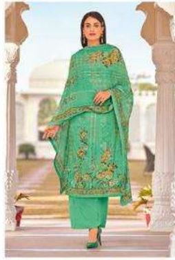
◆ 2532 ◆