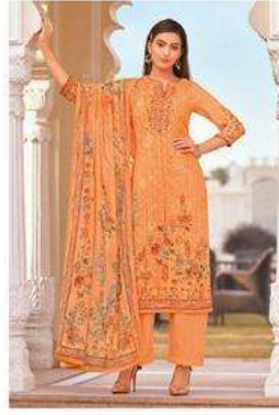
◆ 2533 ◆