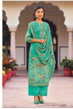
◆ 2535 ◆