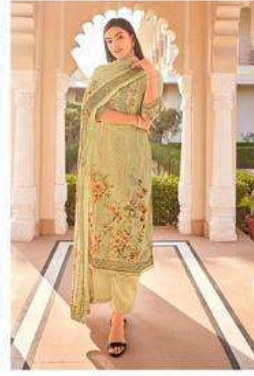
◆ 2534 ◆