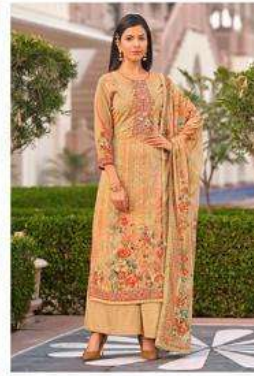
◆ 2536 ◆