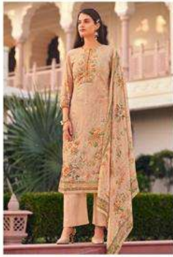
◆ 2531 ◆