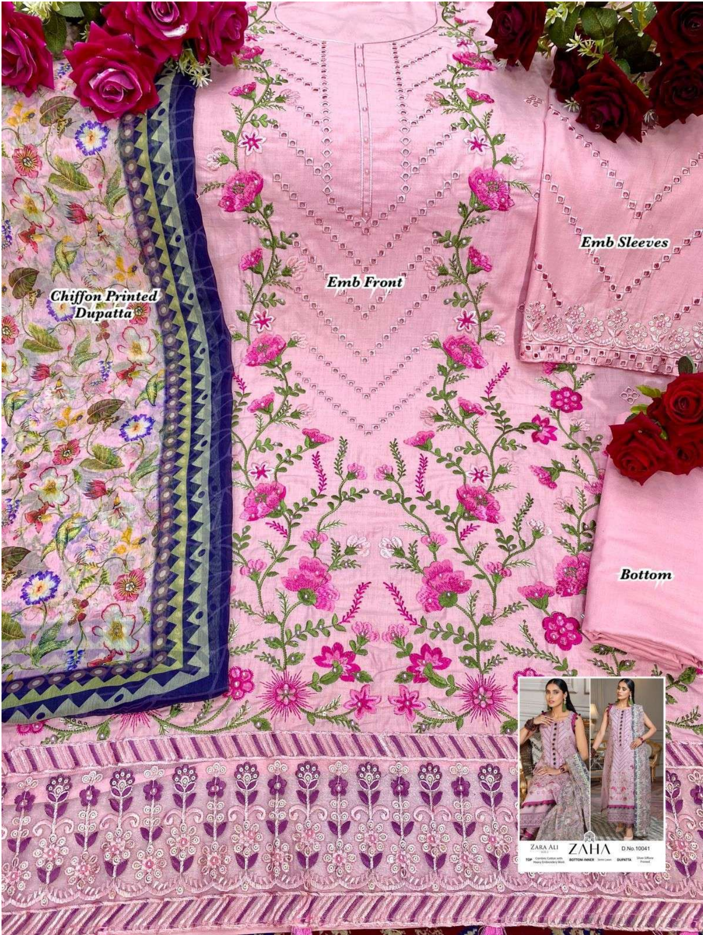
Chiffon Printed Dupatta