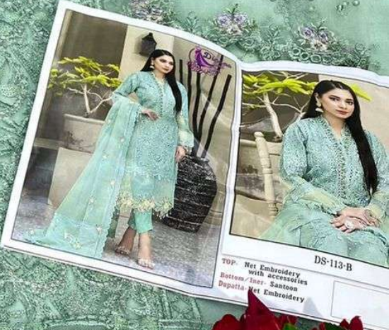
DS-113-B TOP: Net Embroidery with accessories Bottom / Inner: Satin Dupatta: Net Embroidery