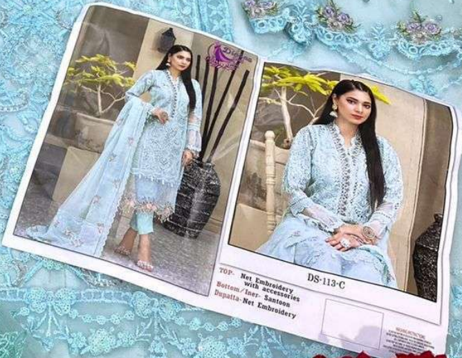
TOP: Net Embroidery Bottom/Iner: Santoses Dupatta: Net Embroidery DS-113-C