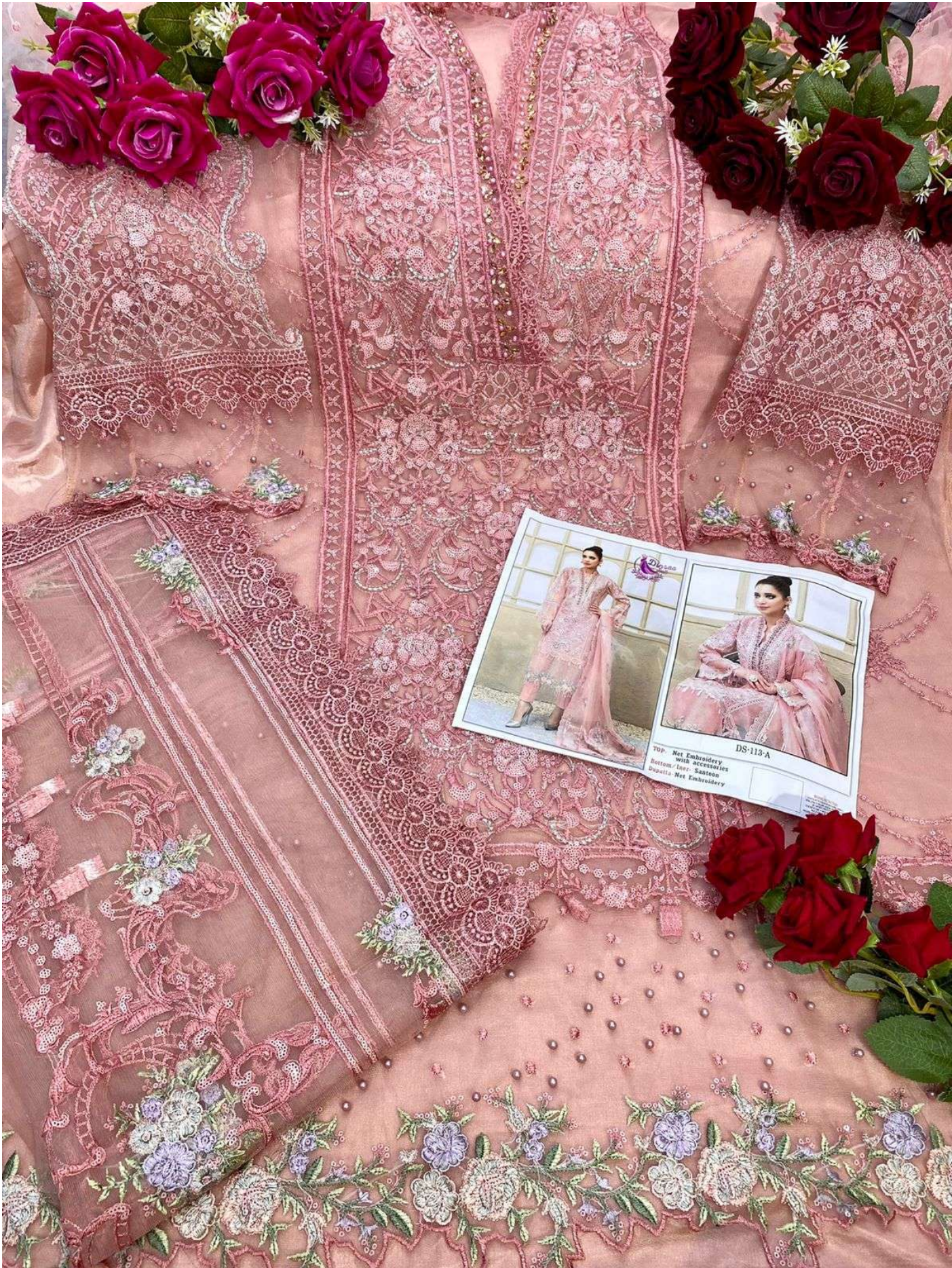
DS-113-A TOP: Net Embroidery with accessories Bottom: Lacer. Satin Dupatta: Net Embroidery