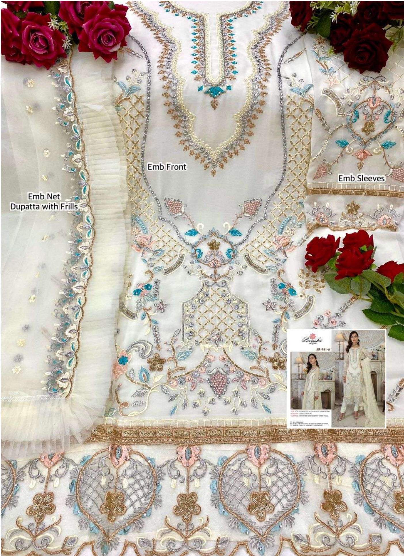
Emb Net Dupatta with Frills