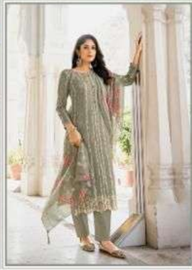
code | 1002