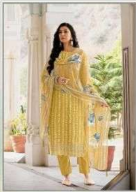
code | 1003