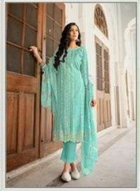
code | 1006