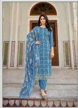
code | 1004