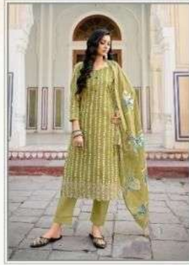
code | 1005