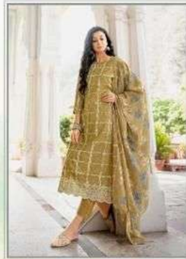
code | 1007