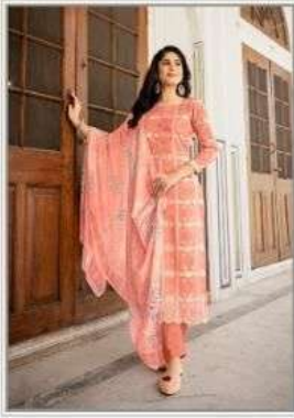
code | 1001