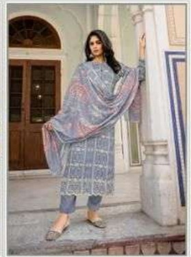
code | 1008