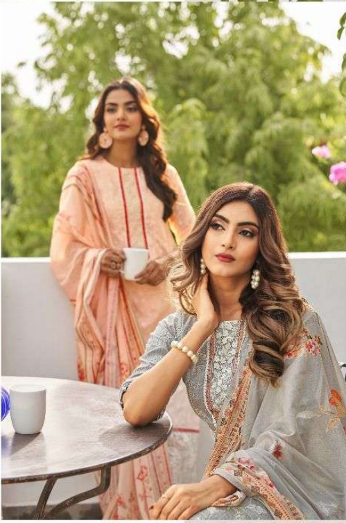
WOVEN IN TIME