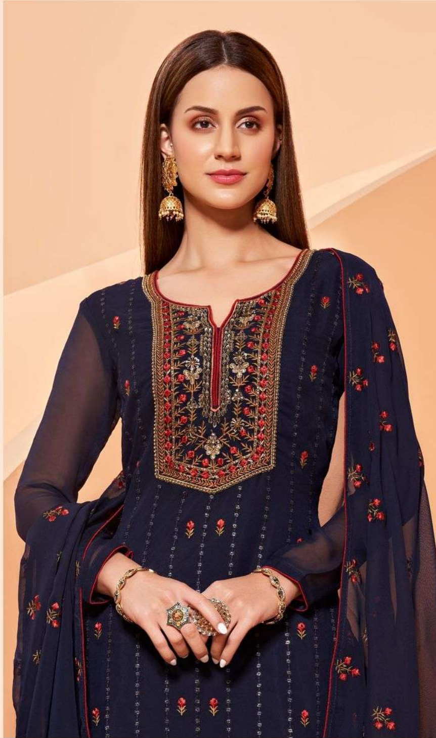
2032 | KEEP CALM & STAY CLASSY If I can have any impact, I want women to feel good about themselves and have fun with fashion.