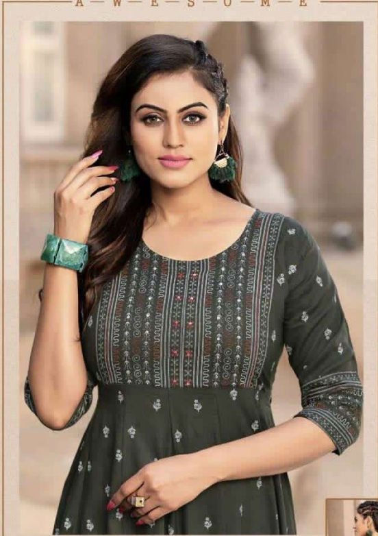
there's a new mood for women and it's full of sophistication glamour and seductive womanly charm