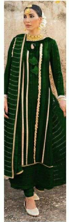
# AFREEN - I