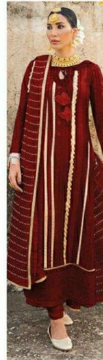
# AFREEN - H