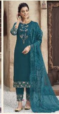
SHAK - 62