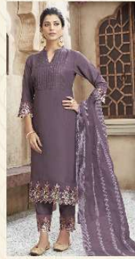
SHAK - 61