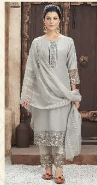
SHAK - 64