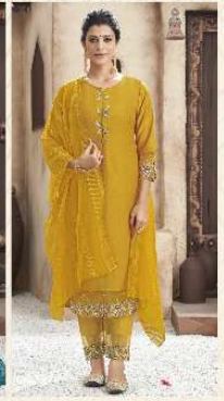
SHAK - 63