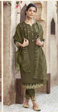
SHAK - 66