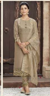
SHAK - 65