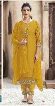
SHAK - 63