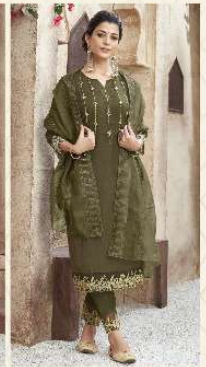
SHAK - 66