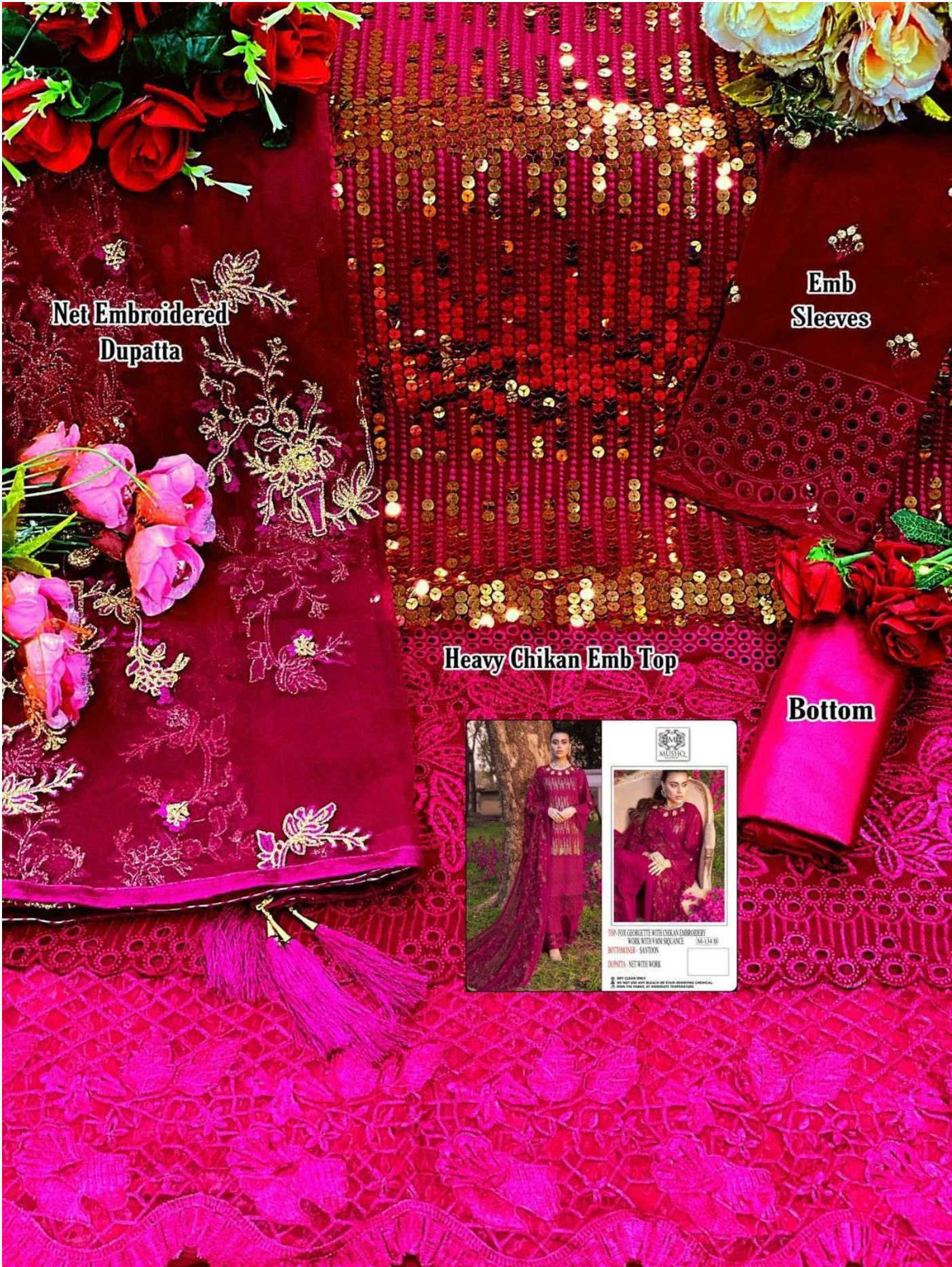
Net Embroidered Dupatta