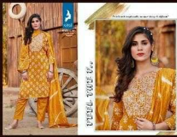
THE BOSSIC OF BOSSIC