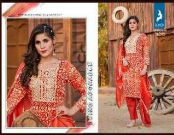
THE BOSSIC OF BOSSIC