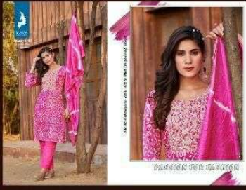
PASTORIC FOR PASTORIC