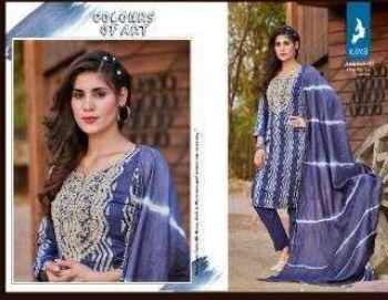
REGAINS OF ART