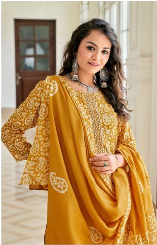
Variable style are, elegance and style is always an integral part of village attire, and when you blend such style, you have a sense of elegance and spirit of soul.