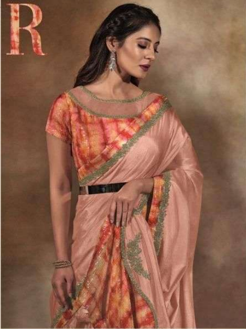
A pretty pastel pink saree combined with digital abstract batik-eye printed sarees and delicate embroidery