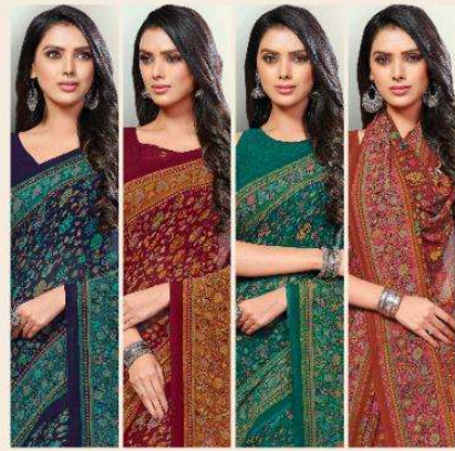
10709A 10709B 10710A 10710B