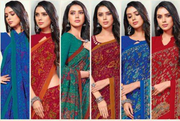
10701A 10701B 10702A 10702B 10703A 10703B