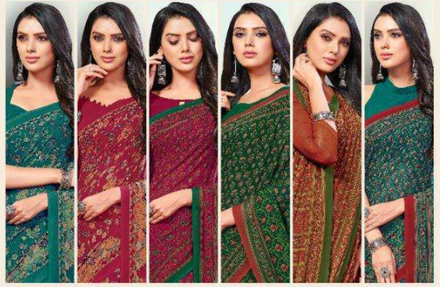
10704A 10704B 10705A 10705B 10706A 10706B