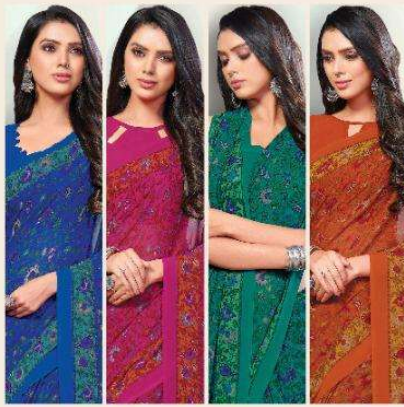
10707A 10707B 10708A 10708B