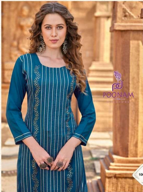
Replace your out-of-date wardrobe with exotically patterned collection and multi color dupatta enhances feminine touch to your personality.