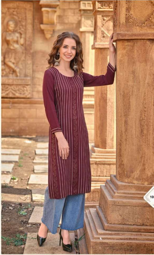
Replace your out of date wardrobe with exotically patterned collection and ed multi color enhances feminine touch..