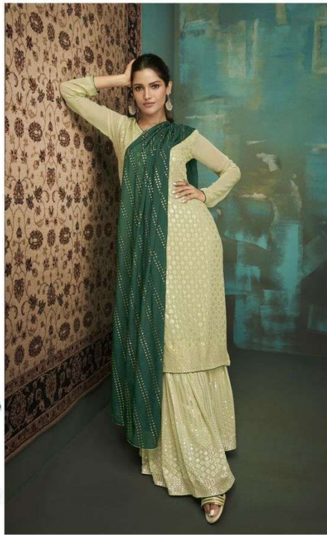
114 Beautiful color with great design sequence work that makes everyone look at you.