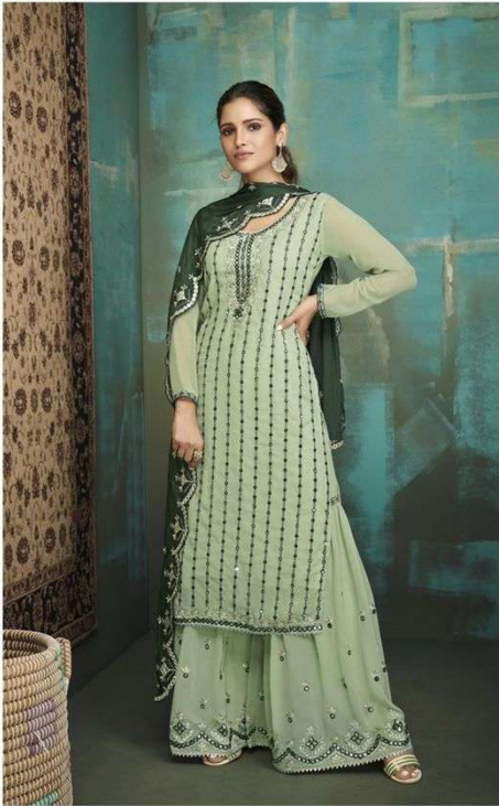
111 These imperceptible shades of cool hold a prestige only revealed on closer inspection buy now - wear forever!