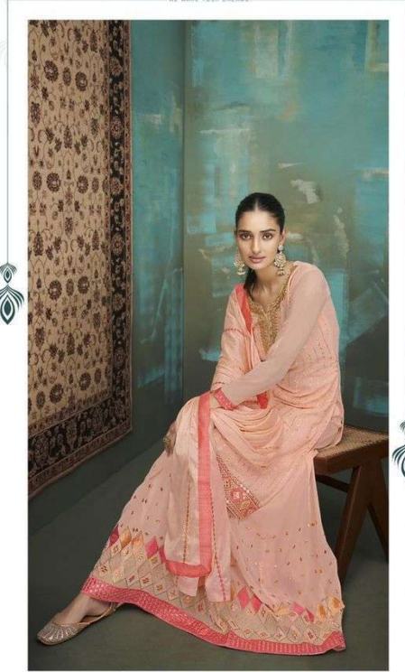
112 | Attractive embroidery work with beautiful contrast color makes the suit more attractive.