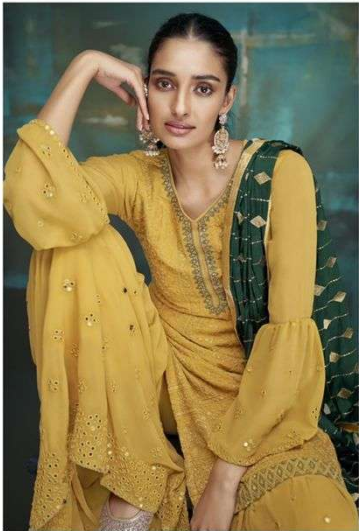
113 Mustard color dress and contrast green scarf, embroidery work from above enhances her adornment.