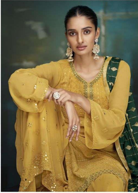
113 | Mustard color dress and contrast green scarf, embroidery work from above enhances her adornment.