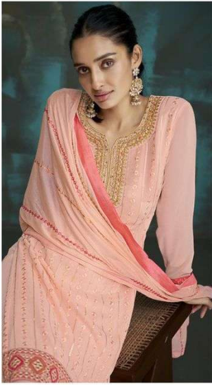
112 | Attractive embroidery work with beautiful contrast color makes the suit more attractive.