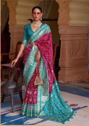
R 113 - A