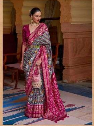
R 113 - F