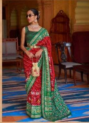
R 113 - B