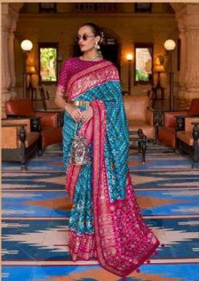
R 113 - C