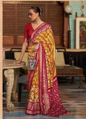
R 113 - G