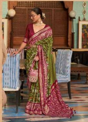
R 113 - D