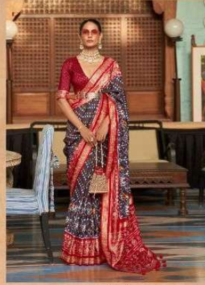
R 113 - E