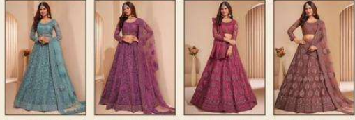
# 1003- F