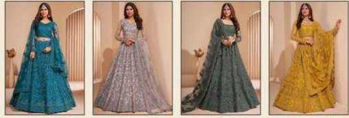
# 1001- F