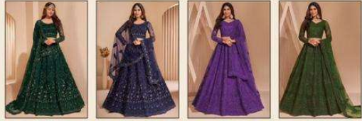
# 1005- F