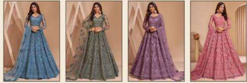
# 1007- F