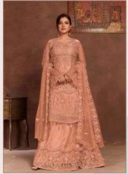
① D.No-202 ①