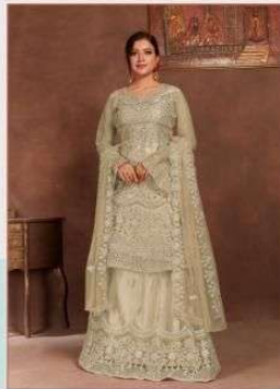
① D.No-203 ①