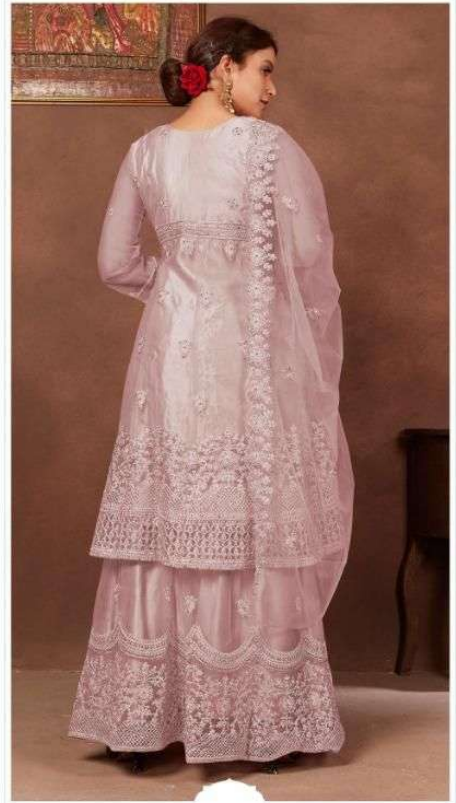
Ⓞ D.No-204 Ⓞ

"WHAT YOU WEAR IS HOW YOU PRESENT YOURSELF TO THE WORLD, ESPECIALLY TODAY, WHEN HUMAN CONTACTS ARE SO QUICK. FASHION IS INSTANT LANGUAGE."