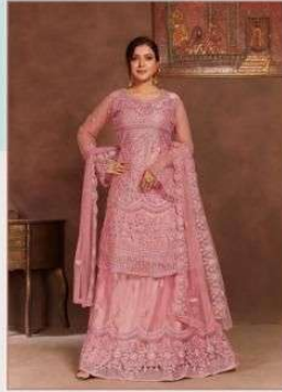
① D.No-201 ①