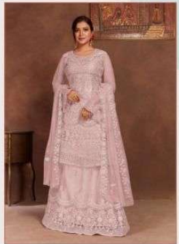
① D.No-204 ①