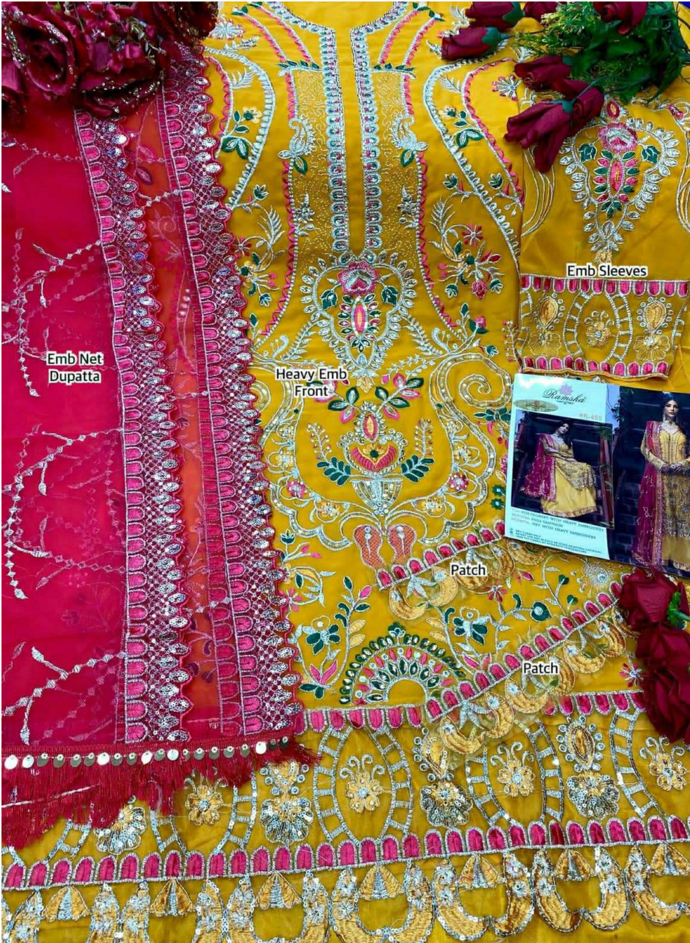
Emb Net Dupatta