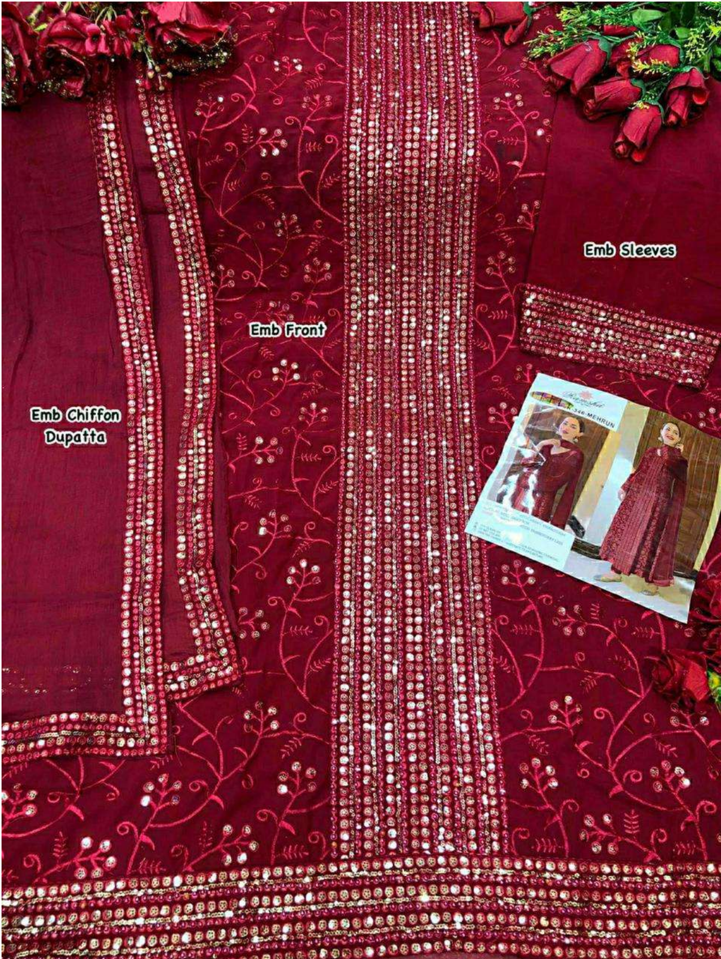
Emb Chiffon Dupatta