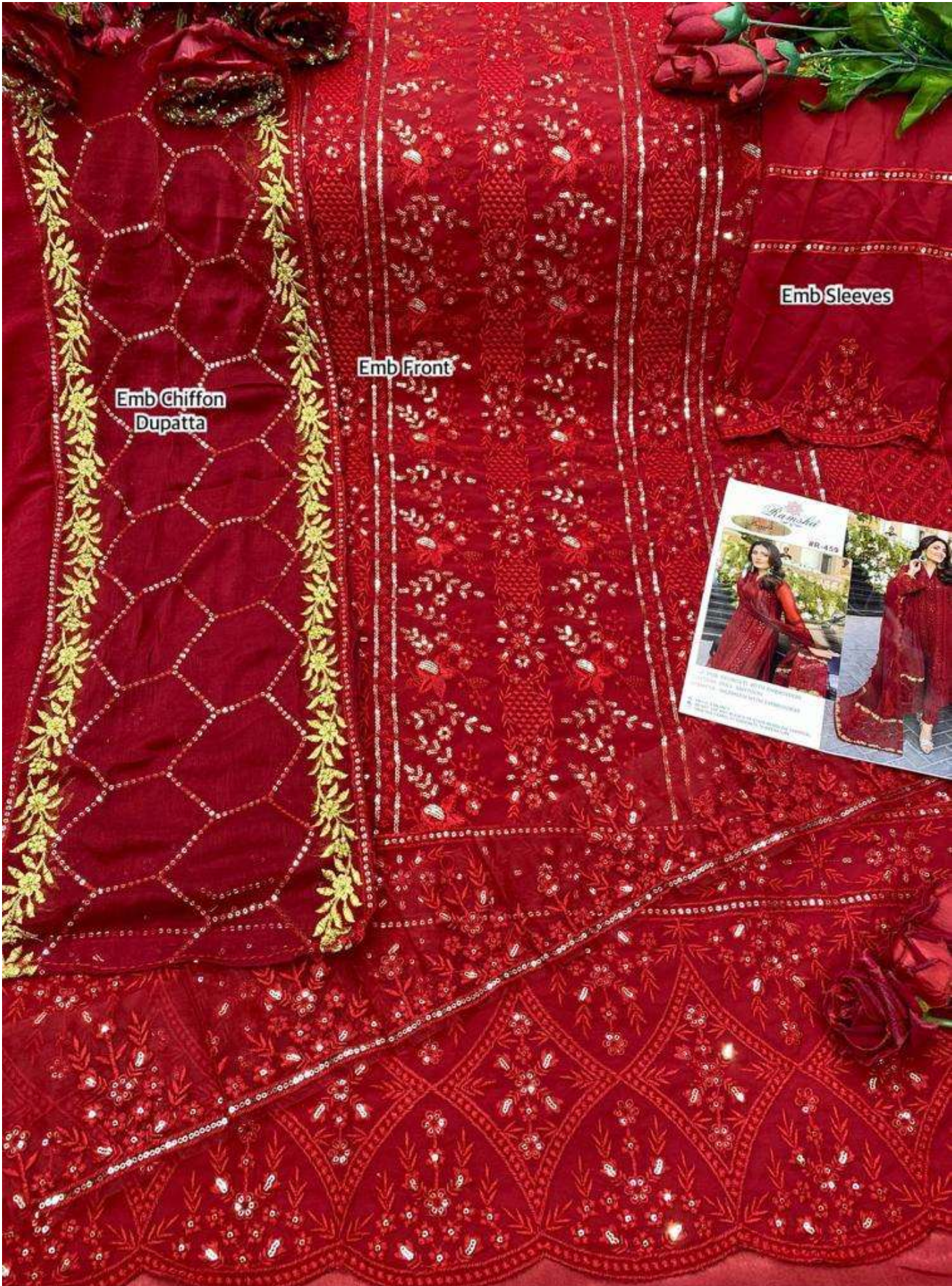
Emb Chiffon Dupatta