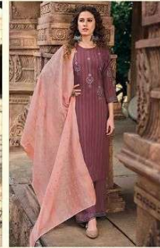
D.NO - 1004