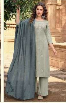
D.NO - 1002