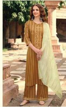
D.NO - 1003