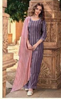
D.NO - 1001