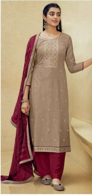
❖ 3301 ❖