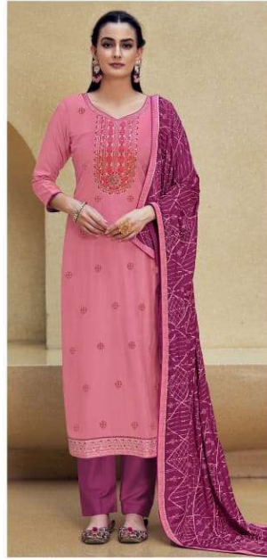
❖ 3303 ❖