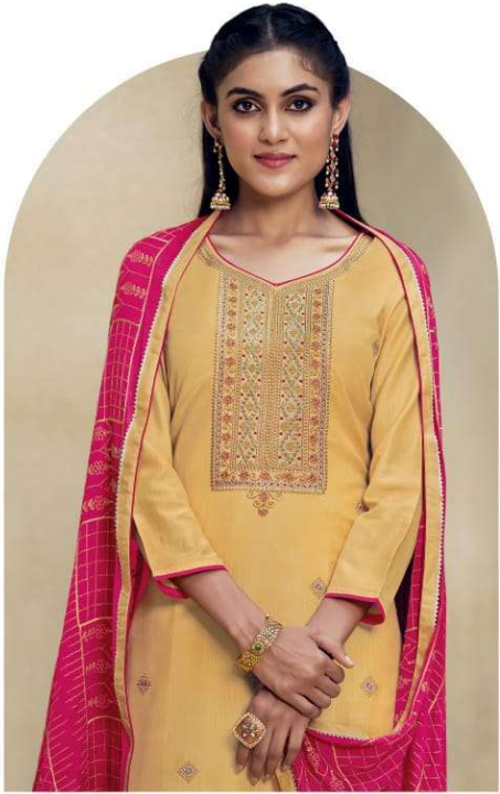
Immerse yourself in unexpected, bright colors & Textures