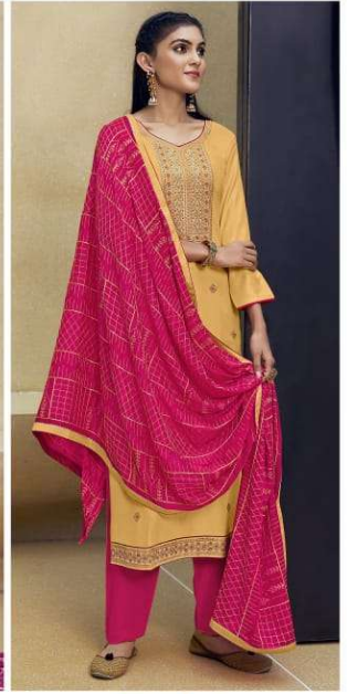
❖ 3304 ❖