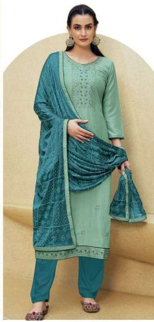
❖ 3302 ❖