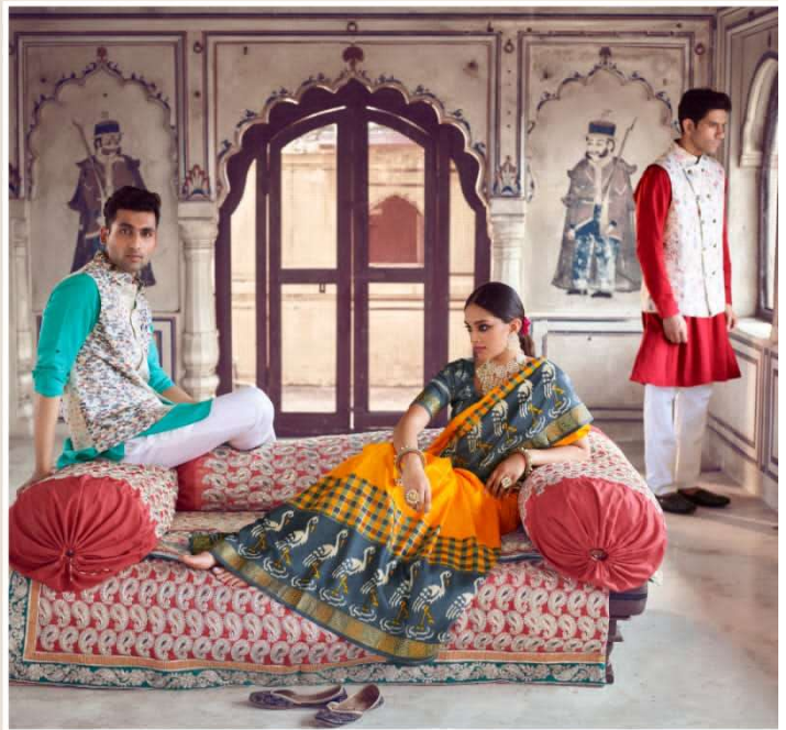
R 109 • the soulful art