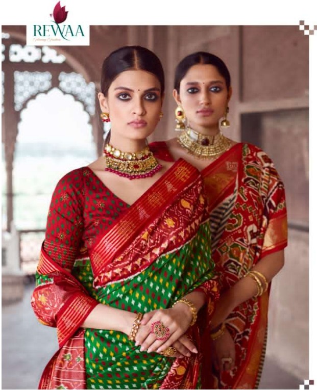
R 113 ■ the timeless treasure