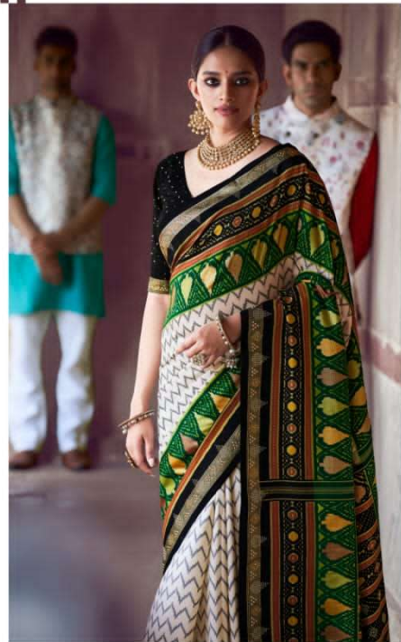
R 115 ■ the elegant radiance