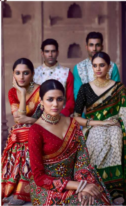
R III ■ the sophisticated philosophy