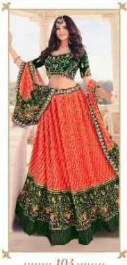
..... 104 .....