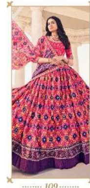
..... 109 .....