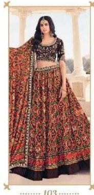
..... 103 .....