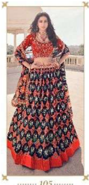
..... 105 .....