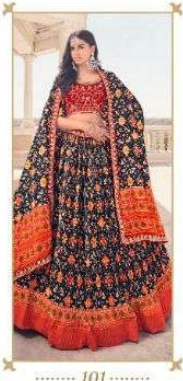
..... 101 .....