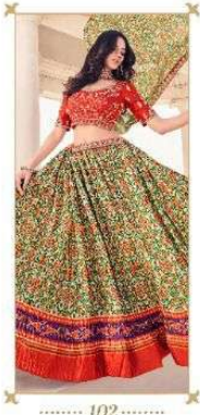
..... 102 .....