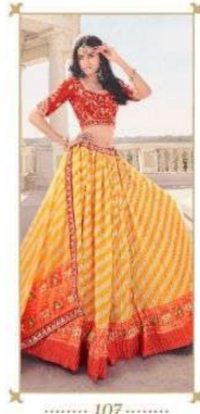
..... 107 .....