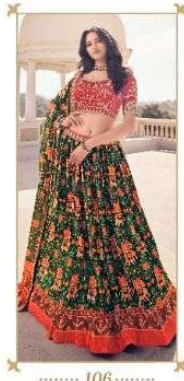
..... 106 .....