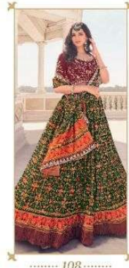
..... 108 .....