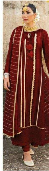
# AFREEN - H