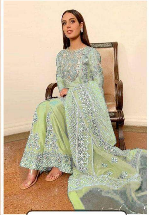
D.NO.116-A TOP:- ORGANZA INNER:- SANTOON DUPATTA:- ORGANZA BOTTOM:- SANTOON