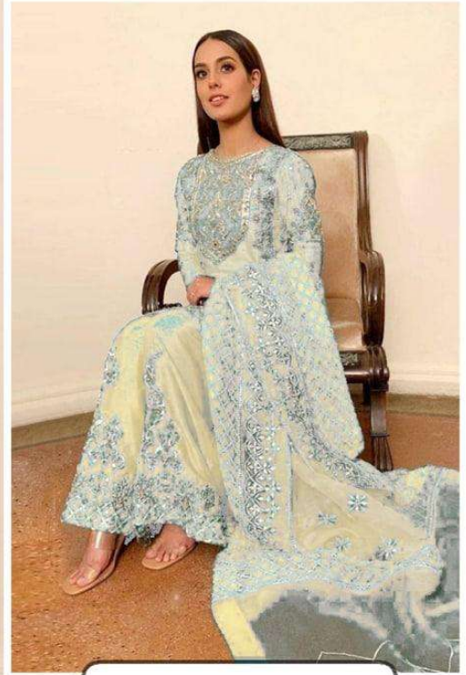
D.NO.116-B TOP:- ORGANZA INNER:- SANTOON DUPATTA:- ORGANZA BOTTOM:- SANTOON