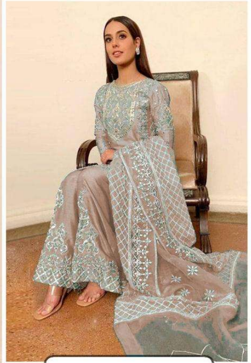
D.NO.116-C TOP:- ORGANZA INNER:- SANTOON DUPATTA:- ORGANZA BOTTOM:- SANTOON