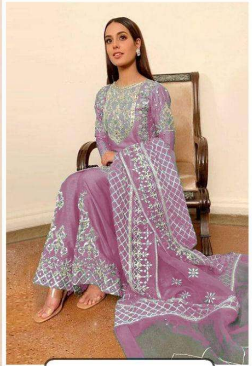
D.NO.116-E TOP:- ORGANZA INNER:- SANTOON DUPATTA:- ORGANZA BOTTOM:- SANTOON