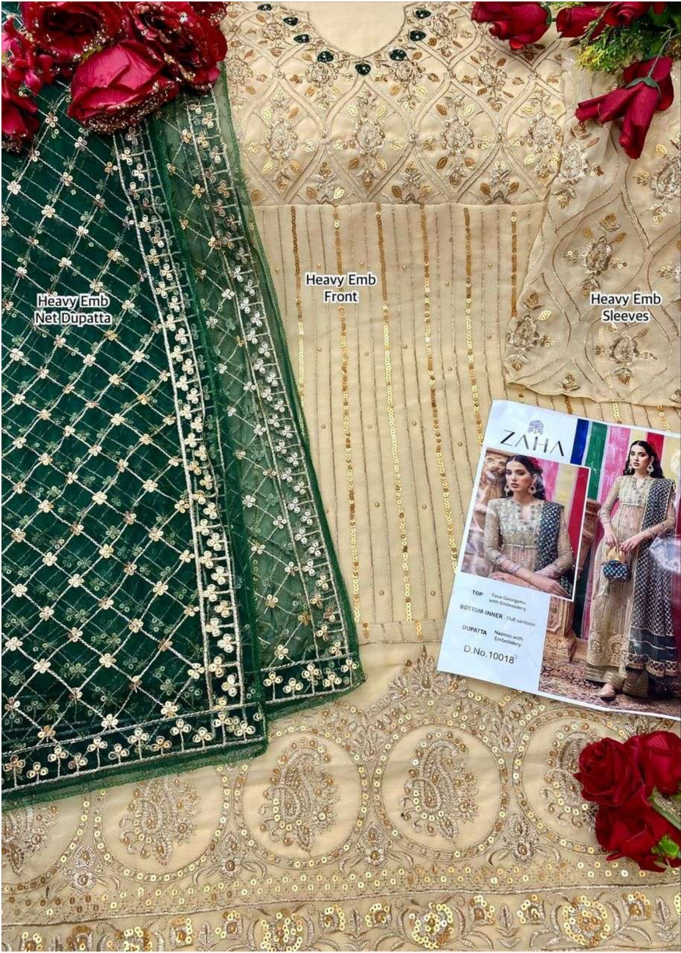
Heavy Emb Net Dupatta