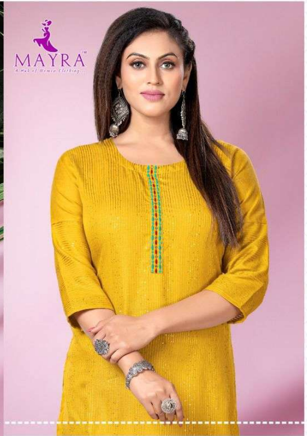
fabrics flow elegantly, exuding an ethereal feel and the ultimate feminine charm