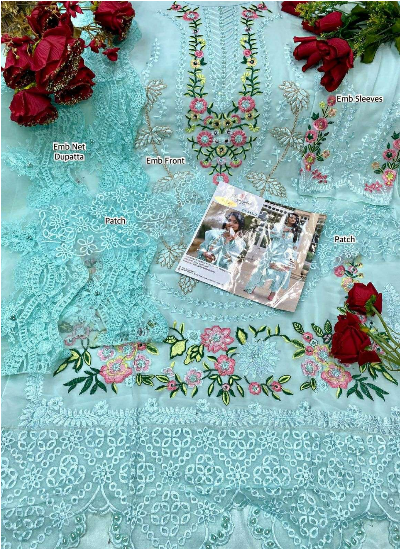
Emb Net Dupatta