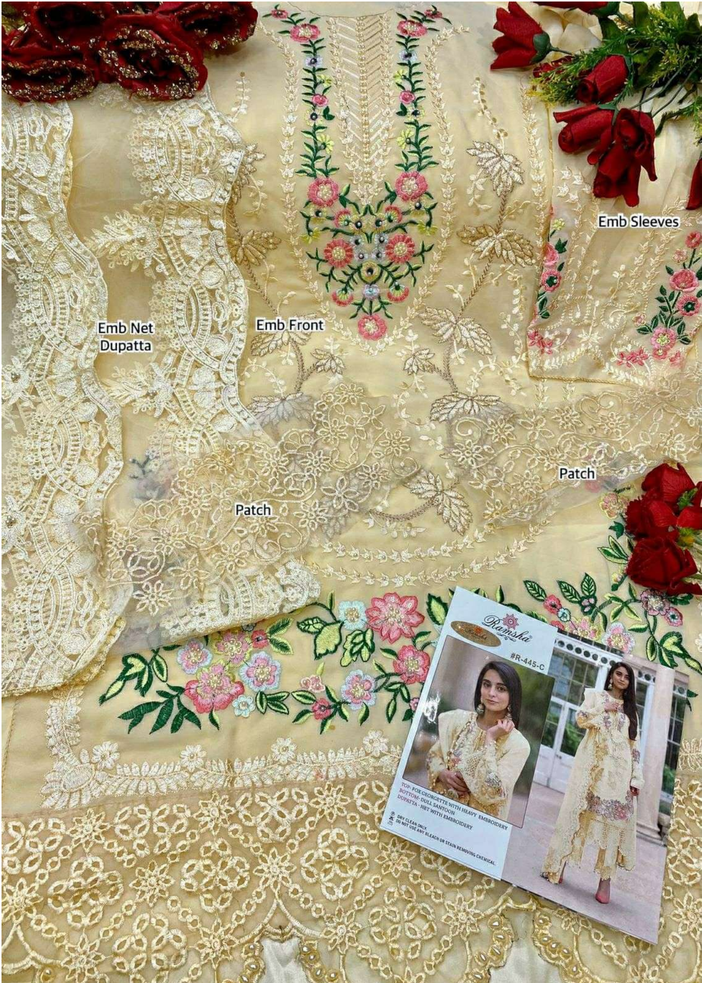
Emb Net Dupatta