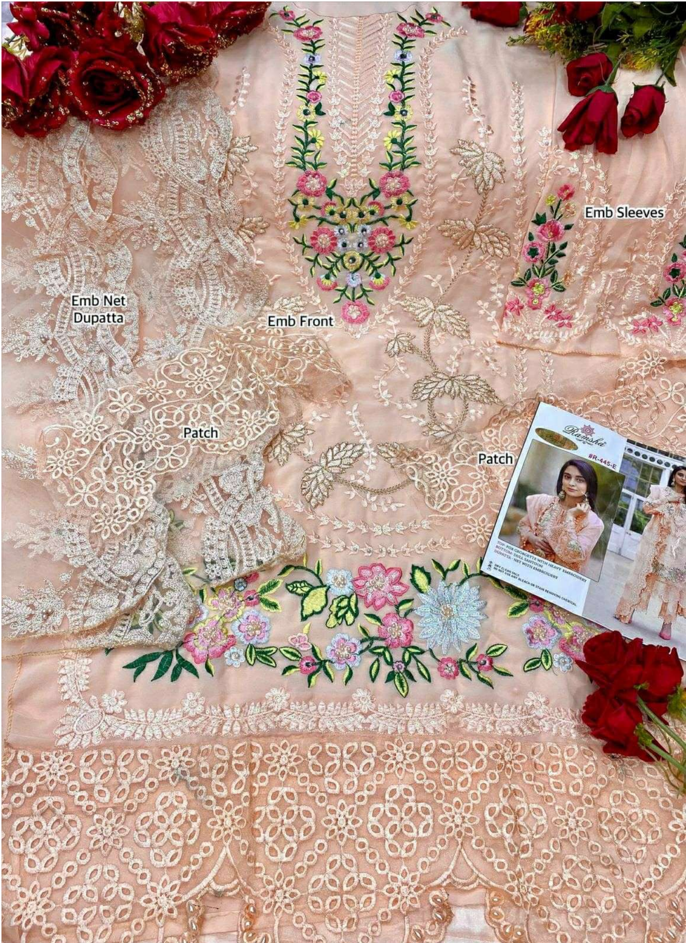
Emb Net Dupatta