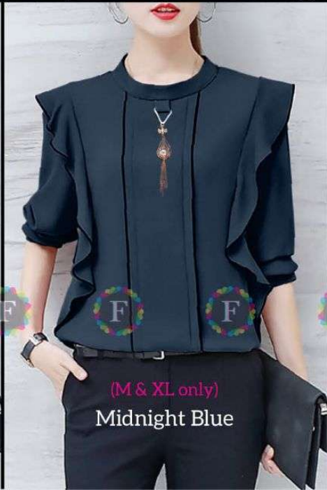
(M & XL only) Midnight Blue