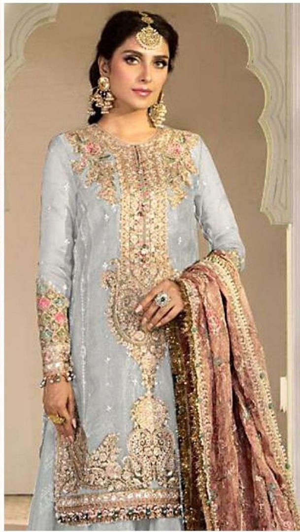
TOP - ORGANZA HEAVY EMBROIDERED INNER - HEAVY SANTOON BOTTOM - HEAVY SANTOON EMBROIDERED DUPATTA - ORGANZA HEAVY EMBROIDERED