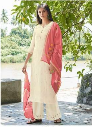
: 5921 :