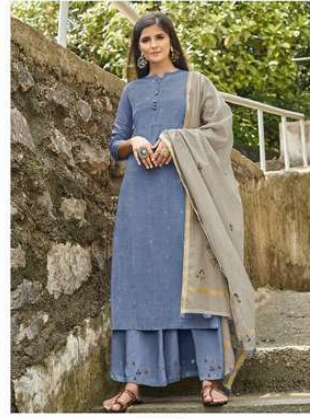
: 5925 :