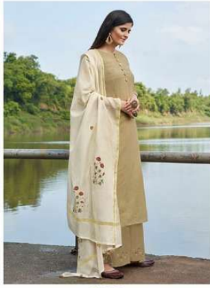
: 5922 :