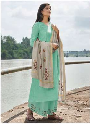
: 5923 :