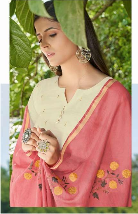
Cast a regal spell with the blend of tradition and modernity : 5921 :