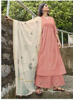
: 5924 :