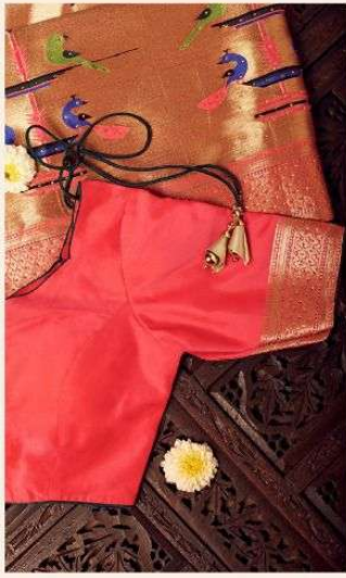
GALARI SILK PANTHANI PALEO SAREE WITH SWARGOPRI WORK ON IT. HAVING DOUBLE-BEDDING CONCEPT FABR SILK BLOUSE AND SECOND KAMA EMBROIDERED BLOUSE