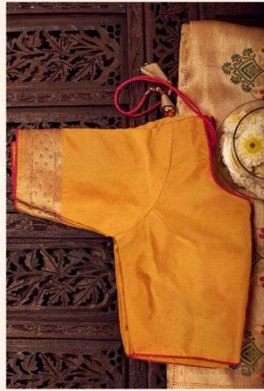
MUSTARD SILK PACHHANI YALLO SAREE WITH SWAROVSKI WORK ON IT, HAVING DOUBLE BOUND CONCEPT, FIRST SILK BOUND AND SECOND RANI EMBROIDERED BOUND.