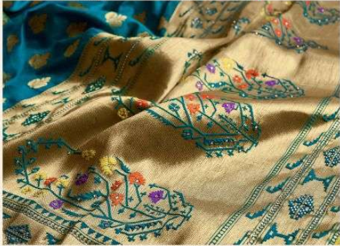
PERCUTI SILK PAITHAN / PAISI SAREE WITH SWAROVSKI WORK ON IT. HAVING DOUBLE KUDUS CONCEPT. FIRST SILK BLOUSE AND SECOND MUSTARD EMBROIDERED BLOUSE.