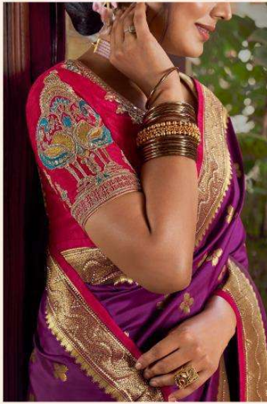
WINE SILK PAITHANI DALLU SAREE WITH SWAROVSKI WORK ON IT. HAVING DOUBT BLOUSE CONCEPT. FIRST SILK BLOUSE AND SECOND RANI EMBROIDERED BLOUSE