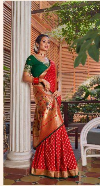
RED SILK PATIHANI PALLU SAREE WITH SWAROVSKI WORK ON IT. HAVING DOUBLE BLOUSE CONCEPT, FIRST SILK BLOUSE AND SECOND BOTTLE GREEN EMBROIDERED BLOUSE