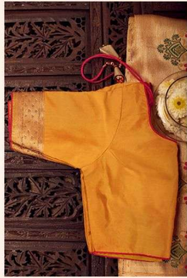
MUSTARD SILK PACHAM FALGU SAREE WITH SWAROVSKI WORK ON IT, HAVING DOUBLE BOUND CONCEPT, FIRST SILK BOUND AND SECOND RANI EMBROIDERED BOUND.