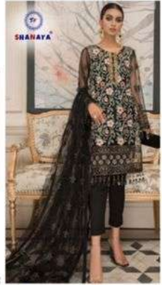
Rose BRIDAL S-105 SHANAYA