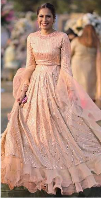
S- 36 A