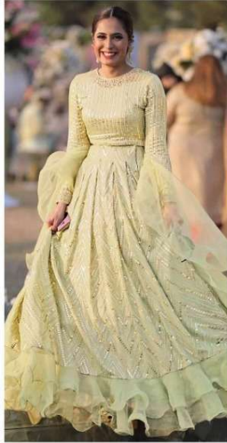
S - 36 C