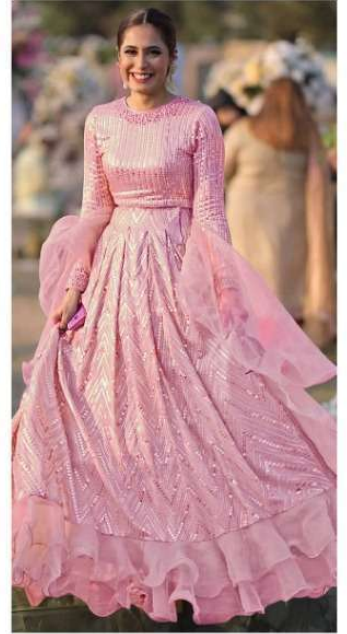
S - 36 D

Top - Fox georgette heavy embroidered with frill Inner bottom - Heavy santoon Dupatta - Butterfly net with moti and frill lace