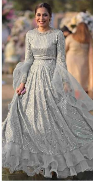
S - 36 B