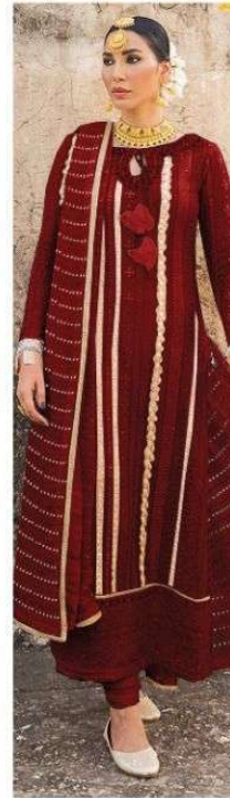
# AFREEN - H