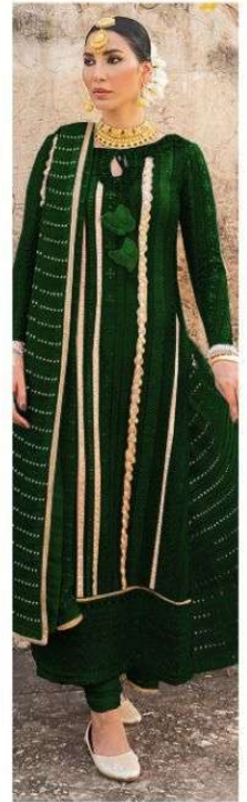
# AFREEN - I