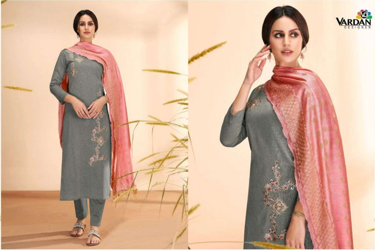
Our style show our fashion club... D.NO:18013