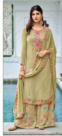
▶ 1319 ◀