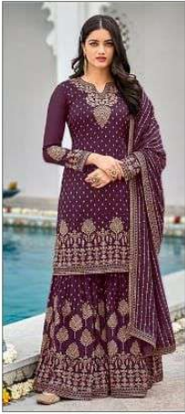
▶ 1314 ◀