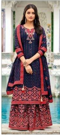
▶ 1316 ◀