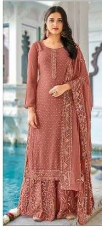
▶ 1317 ◀