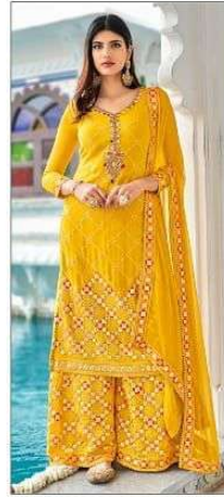
▶ 1318 ◀