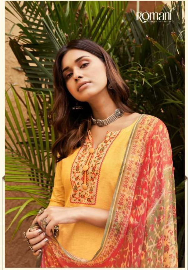
Mirai Mirai is a collection of hand-embroidered fabrics, featuring a mix of traditional and modern designs. The collection is available in a variety of colors and patterns. View more 1018-007