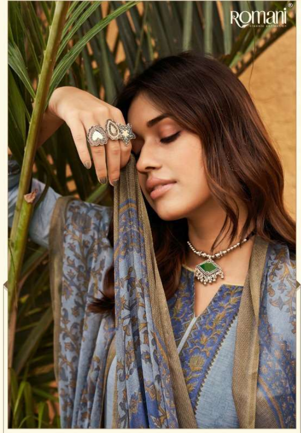
Mirai Mirai is a collection of the finest fabrics in a palette of soft pastels and bold vibrant hues. 1018-006