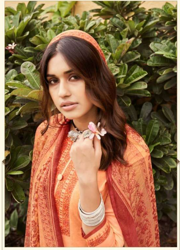
Mirai Mirai is one of the greatest fashion designers of the season and has created just what a new arrival, and you'll love it. 1018-005