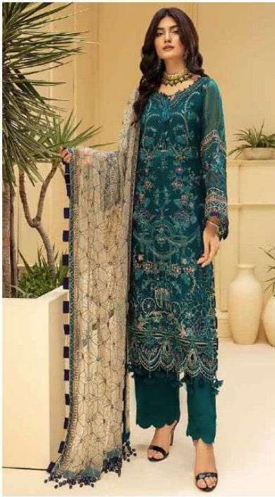
Z - 2100