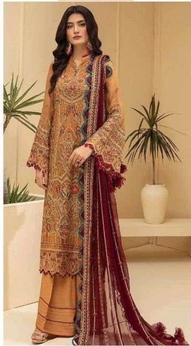
Z - 2101