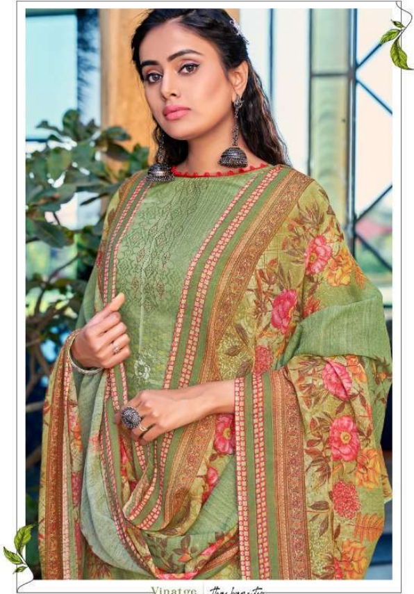
Vinatge the beauty A SHARADHA BRAND FASHION DESIGNER IN INDIA D.NO 2008