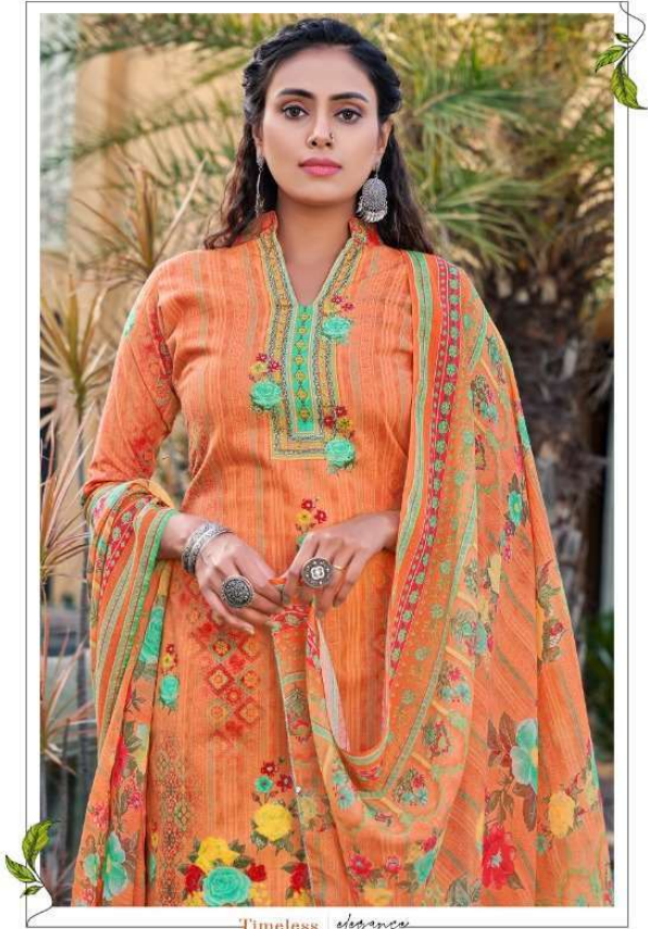
Timeless elegance A collection of hand-embroidered garments by Anamika Khanna D.NO 2010