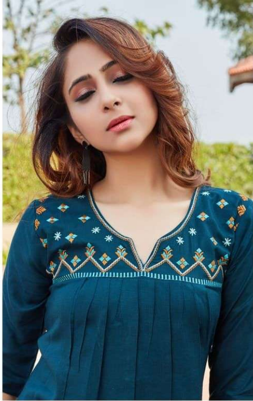
CREAM OF THE CROP