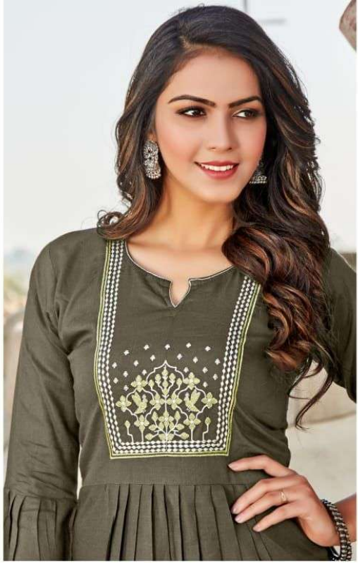
CREAM OF THE CROP