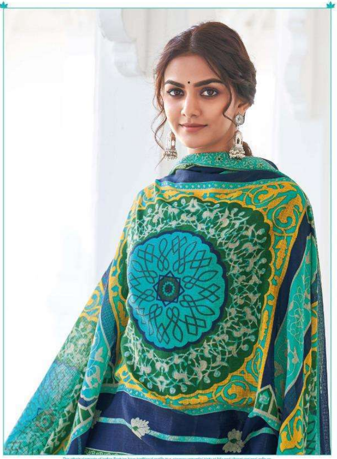
The ethnic elements of Indian Pashmina from traditional motifs in customary material made of like and vibrant regional colours.