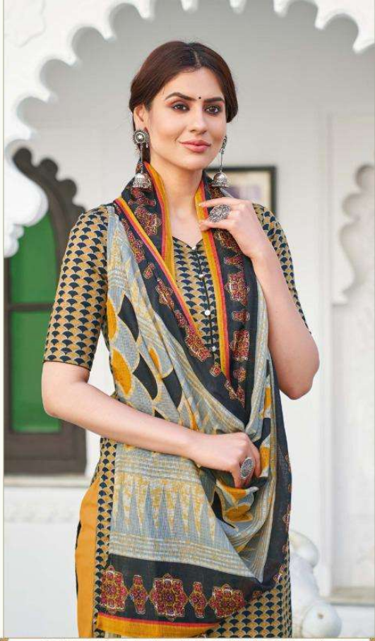
The intricacies of Indian Fashion from traditional motifs to contemporary essences, melds in soft and vibrant regional colours.