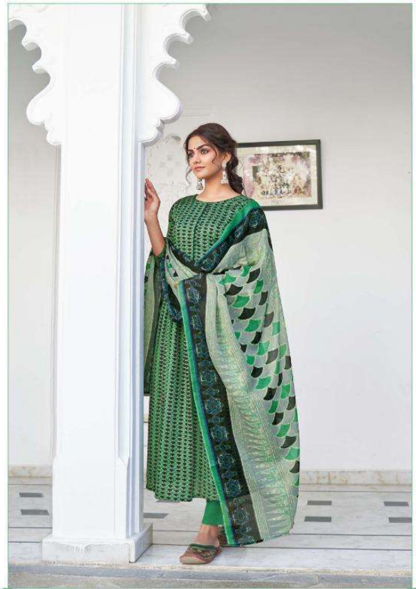
The ethnic elements of Indian Fashion form traditional motifs and ornaments essential traits of folk art vibrant regional colours.