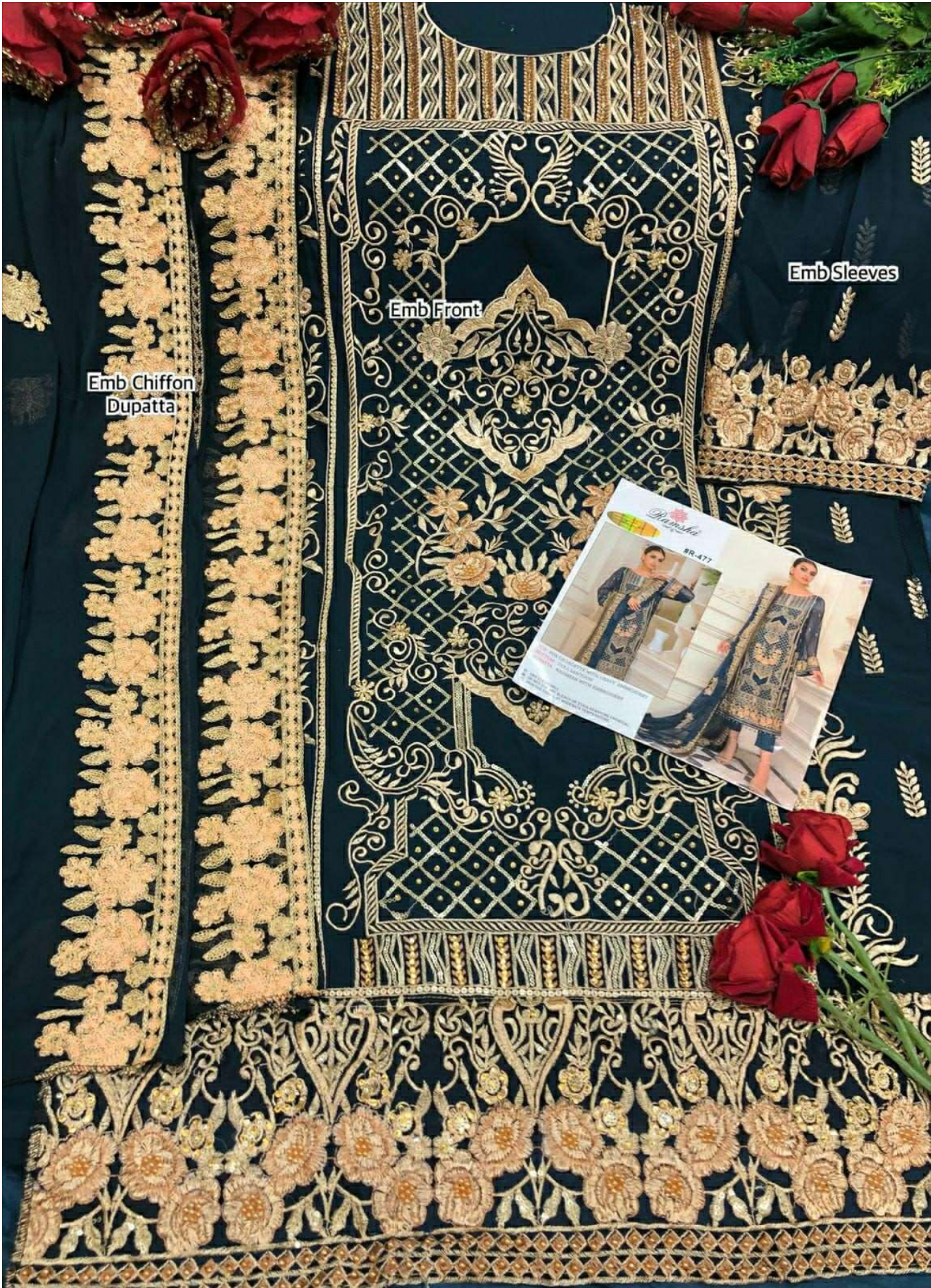
Emb Chiffon Dupatta